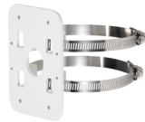
PFA152 Pole mount